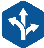
Conflicts of Interest