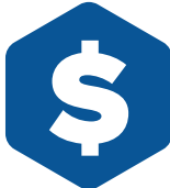
Bribery and Corruption