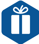
Gifts and Entertainment