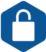
Protecting LKQ Property