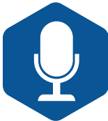
Speaking on Behalf of LKQ